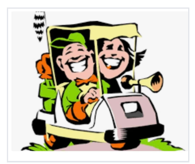
Thank you all that have signed up! All 50 Spots are Full! Please pay Jerry-Monica Dowell . Lot 221. Can't wait for the Rally!!!

Check out our Cedarshores website to see all the information on our candidates as well as colorful details on the events going on from now until the end of our camping season.